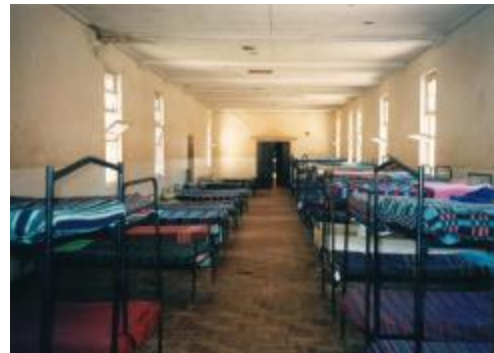
Dormitory, Junior Block; how about a return, chaps?