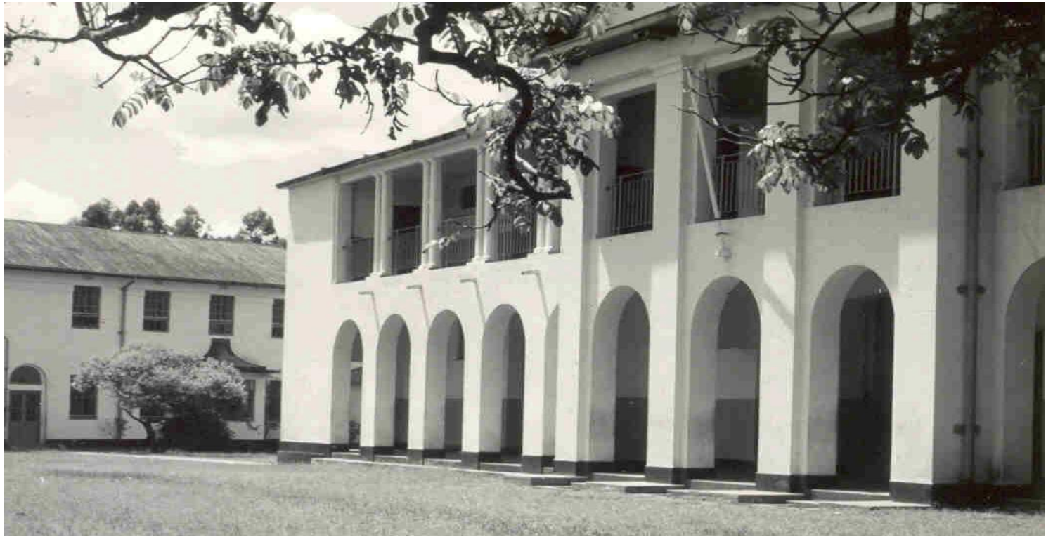
Tuition Block and Junior School, April 1961